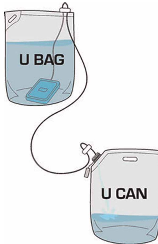
Figure 1 | Diagram describing the use of the Nerox™ filter.

The Nerox™ filter (A-Aqua, Oppegard, Norway) is a gravity water filter system (Figure 1) that employs a 0.28 µm