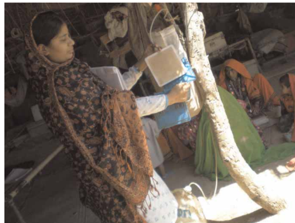
Figure 4 | Blocked Nerox™ membrane filter.

The majority of the study participants appreciated the visual improvement in water quality and an improved taste, which was associated with a perceived positive health impact. However, many problems were reported too. The long time needed to filter water, and the small quantities provided per day were reported by almost all study participants as problematic. Over 90% of the study participants cleaned the filters, either daily or every second day, although the manufacturer states that every 3 to 7 days should be sufficient. The frequent cleaning of the