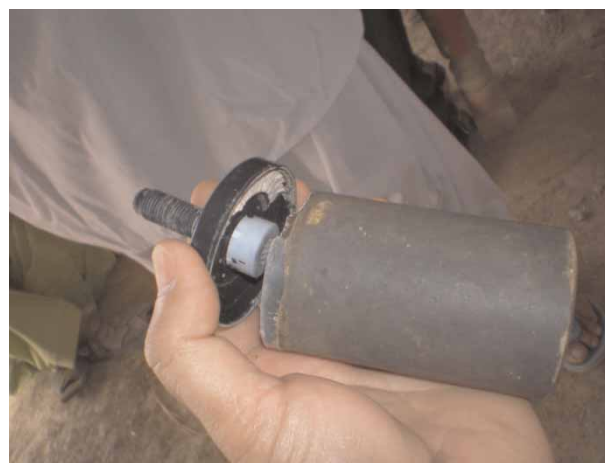
Figure 3 | Broken ceramic filter.

maximum turbidity concentration found for irrigation water of over 900 NTU. TTC concentrations in source water ranged from 138 to 600 CFU/100 ml. Seepage water from irrigation canals retrieved by hand pump was of the best